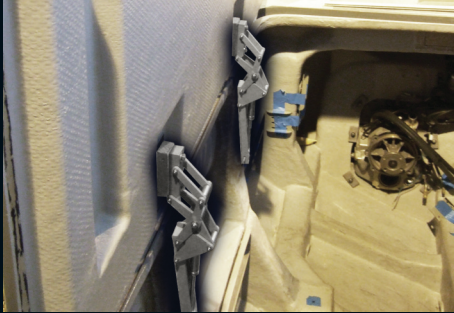
85° opening engine hatch hinge