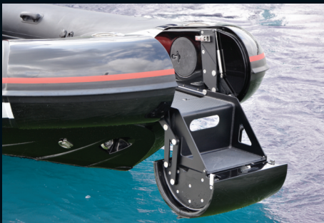
92° drop down bow step