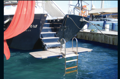
180° convertible deck to diving platform