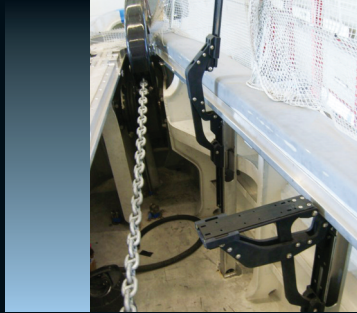
95° opening anchor locker hinge