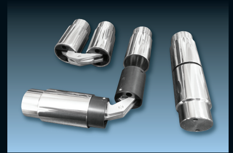
180° opening tube hinge