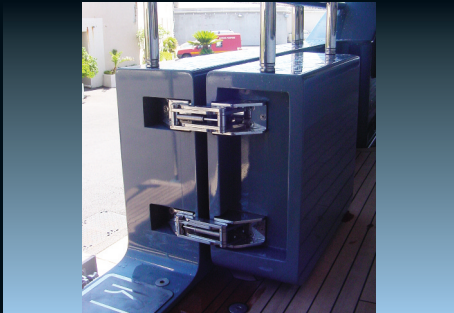
180° opening bulwark door hinge