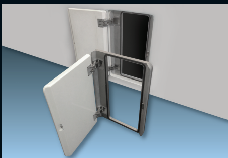
175° opening glue in locker door unit