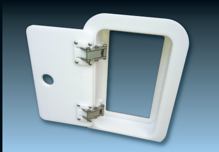
180° opening hinge (no seal)